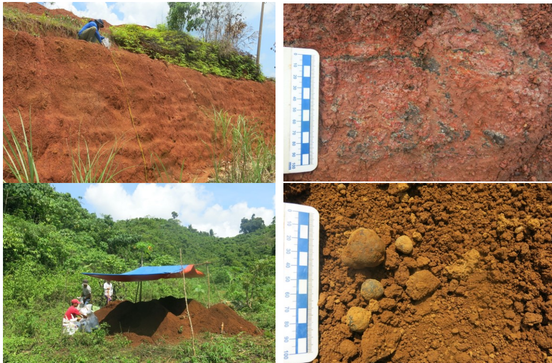
Figure 2. Field occurrence of the bauxite in Paranas, Samar, Philippines.

Based on aluminium oxide content, the karst bauxites were classified as low grade (< 44 wt.% \text{Al}_2\text{O}_3 ), medium grade (44-47 wt.% \text{Al}_2\text{O}_3 ), and high grade (> 47 wt.% \text{Al}_2\text{O}_3 ). Data from X-ray fluorescence analysis show no significant variability in major oxide composition within the first four meters of the test pit soil profiles (Table 1). In addition to aluminium oxide, bauxite also contains elevated concentrations of \text{Fe}_2\text{O}_3 , \text{SiO}_2 , and \text{P}_2\text{O}_5 . In terms of rare earth element concentration, low-grade bauxite has an average total REE+Sc+Y of 328 ppm, while medium grade bauxite has an average of 469 ppm. The high-grade bauxite has the highest REE concentration of 722 ppm.